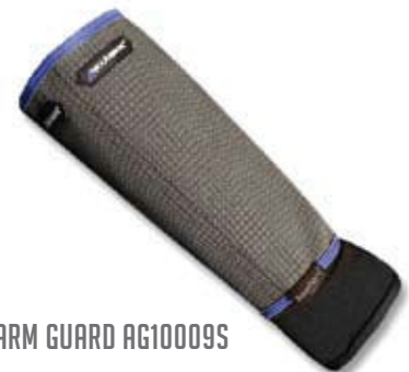
9" ARM GUARD AG10009S