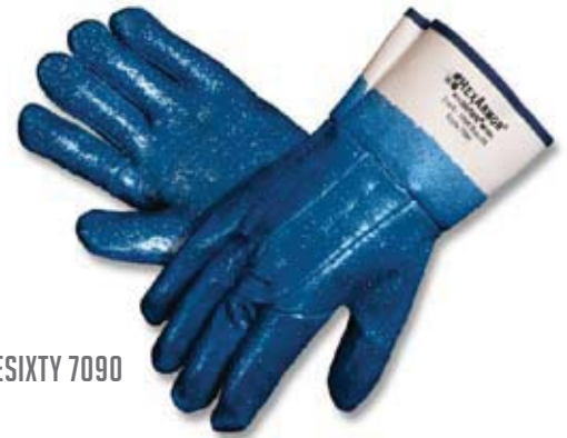
TENX THREESIXTY 7090