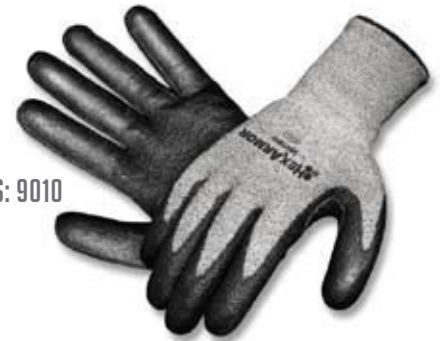
LEVEL SIX SERIES: 9010