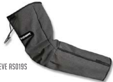
19" ARM SLEEVE AS019S